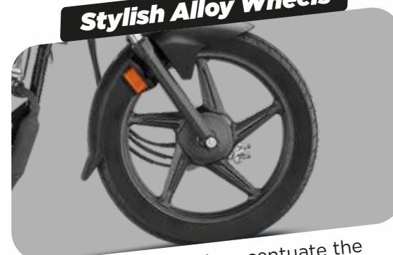
Stylish Alloy Wheels All-black alloy wheels accentuate the overall look of the bike.