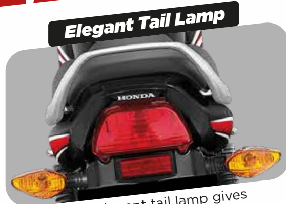
Elegant Tail Lamp Bright and elegant tail lamp gives the bike an imposing look from the back.